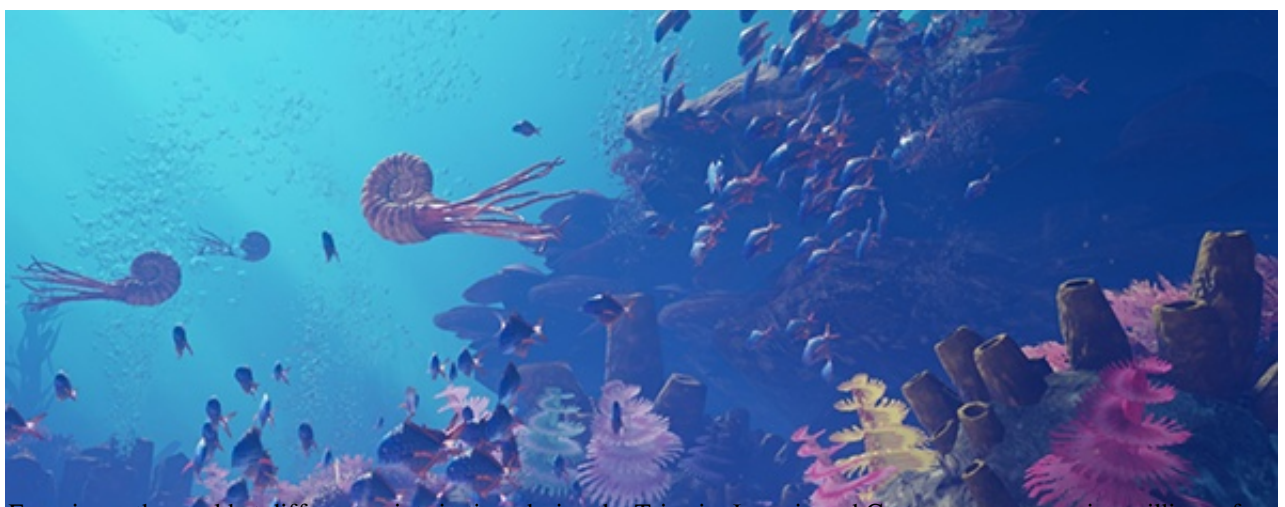
Experience the world at different points in time during the Triassic, Jurassic and Cretaceous eras spaning millions of years in a few hours.