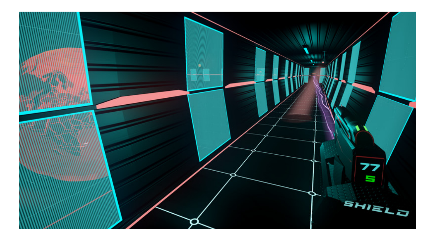
Time Transit VR Torrent Download [Xforce Keygen]